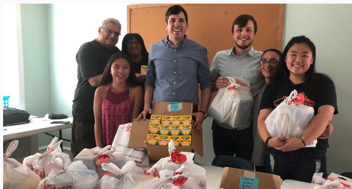
Baptist Church of West Chester and their school supply donation

"We are very excited to start the After School Programming this year! My team and I have been developing great clubs and activities to help the students feel like there is something for everyone! But most importantly, we seek to keep them growing in their confidence, their knowledge, and their skills. From baking, to learning Spanish, and even extra help on homework, After School Program is a place where students come in feeling safe and welcomed. They share a healthy meal with their classmates, followed by individual reading, or study hall. We love providing a time for our students to become well rounded individuals, beyond the classroom setting. We would love your support in prayers, or even volunteer help!"