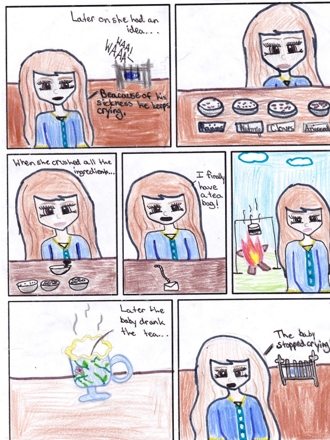
Donna is in fourth grade. She likes art and doing fun activities.